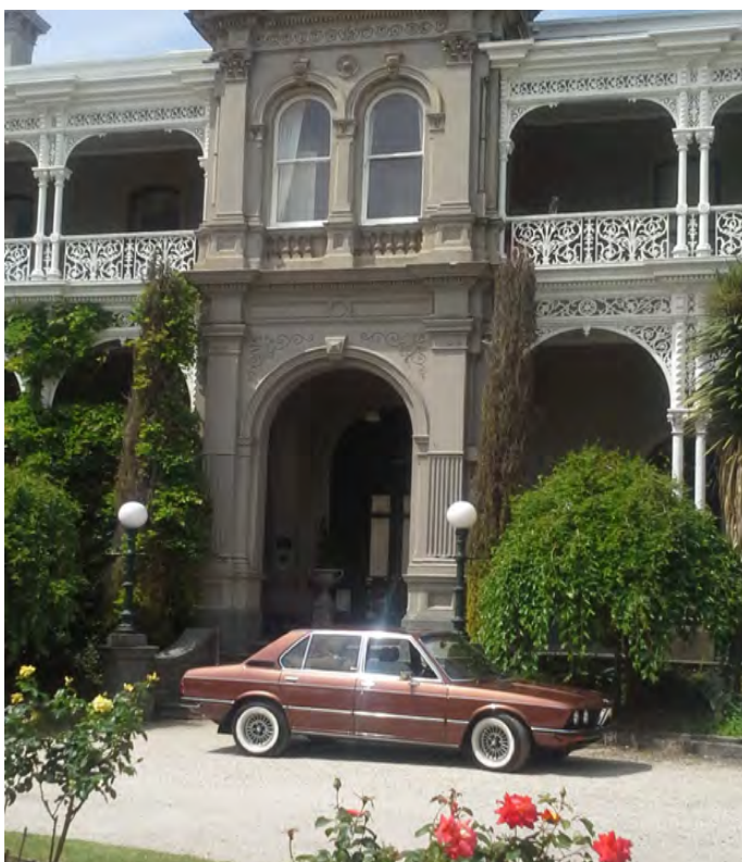
Top Marque 14