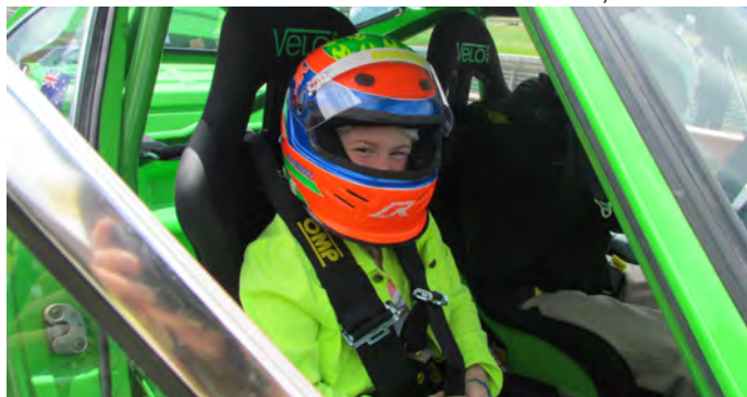
Top Marque 18