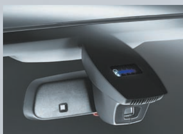
High Beam Assist