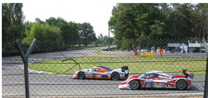
Lola-Aston Martins had the best sounding exhausts. Here one is lapping the Lola-Honda (no. 25) at Arnage corner