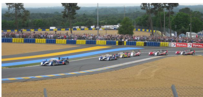
Three Peugeots are chased by 3 Audis on the opening lap