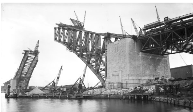
Top Marque 28

It is interesting to note that The Sydney Harbour Bridge design had to perform functionally and be aesthetically pleasing as well so the four pylons on each corner of the bridge are not structural. The 90 metre high pylons are made of concrete that is covered by grey granite from Moruya, south coast NSW, where 250 Australian, Scottish and Italian stonemasons and their families lived in a temporary settlement.