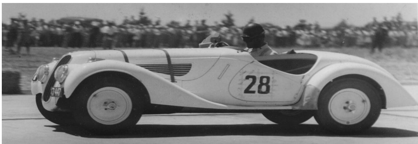
Top Marque 2